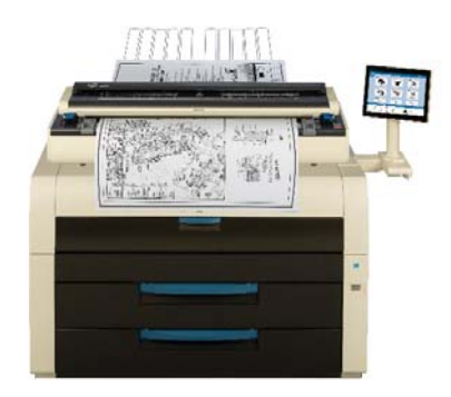
KIP 7990 MFP system with KIP 2300 CCD production scanner