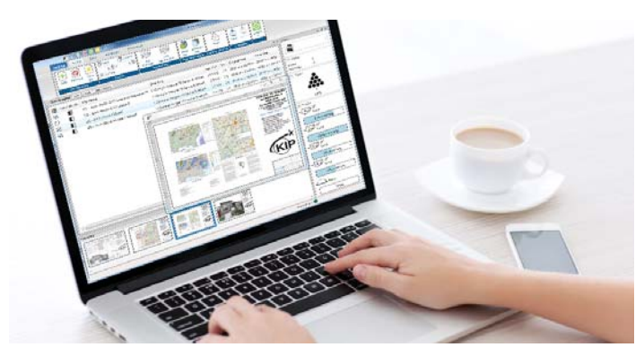
KIP Print Submission Designed for Windows® PCs, KIP PrintPro is an intuitive system management and print submission application for the complete range of black & white systems.