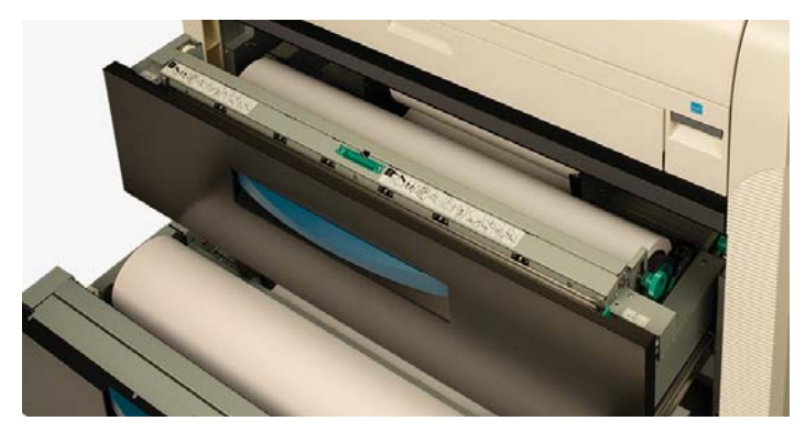
Quick Switch Technology The KIP 70 Series print technology eliminates roll switching delays for increased productivity. Two or four media rolls and a sheet feeder deliver mixed print sizes at full production speed.