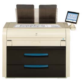
KIP 7570 network print system with integrated top stacking print tray