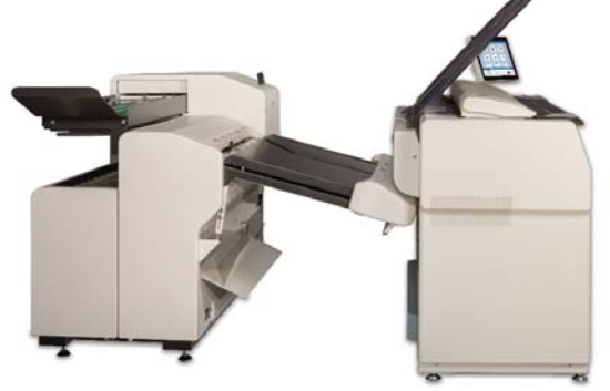
KIP 7170 production system with optional KIPFold 2800 online fan folder