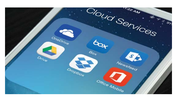
KIP Cloud Connect Sharing online content via popular Cloud Services has become a critical collaboration tool. Scan to and print from the cloud directly at the multi-touch display.