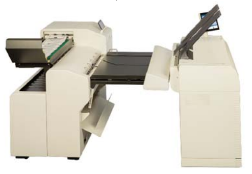
KIP 7570 print system & optional KIPFold 2800 online fan & cross folder

KIP 7590 MFP system with KIP 2300 CCD production scanner