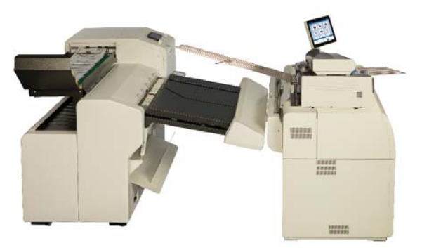
KIP 7990 production system with KIP 2300 scanner & optional KIPFold 2800 online fan & cross folder