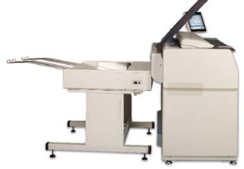
KIP 7170 production system with integrated top stacking print tray & optional KIP 1200 high capacity stacker