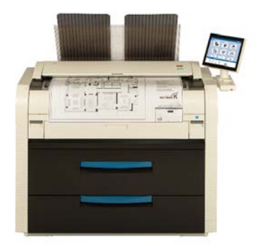
KIP 7580 multi-function system with integrated CIS scanner & top stacking print tray