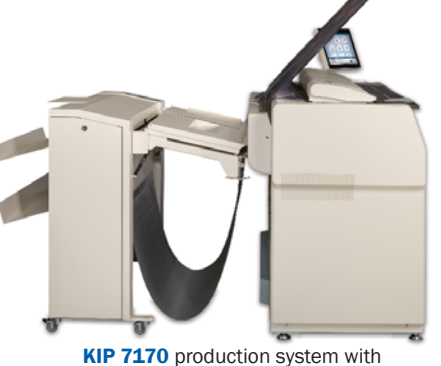
optional KIPFold 1000 online fan folder