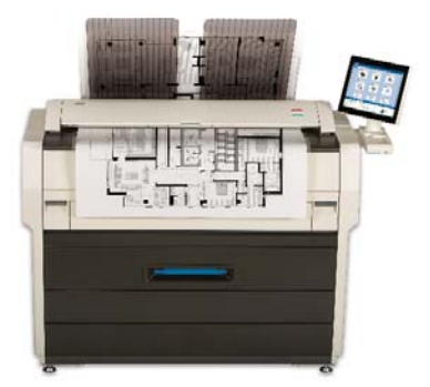
KIP 7170 multi-function system with integrated top stacking print tray