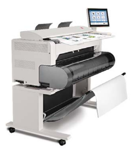
KIP 770 multi-function print, copy, & scan system (with included color scanning)