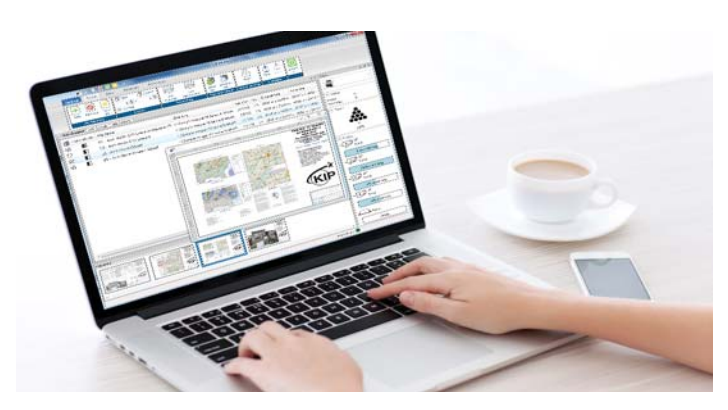
KIP Print Submission Designed for Windows® PCs, KIP PrintPro is an intuitive system management and print submission application for the complete range of black & white systems.