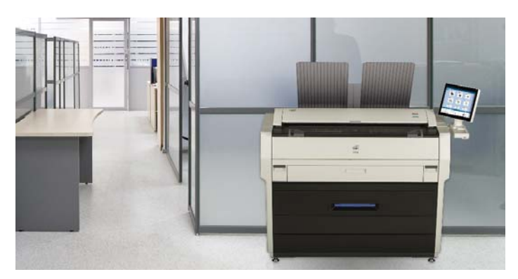
Space Saving Footprint | Installation Simplicity Compact mechanical design with ease of serviceability as an engineering priority.