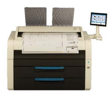
KIP 7980 multi-function system with integrated CIS scanner & top stacking print tray