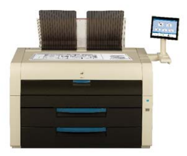
KIP 7970 network print system with integrated top stacking print tray