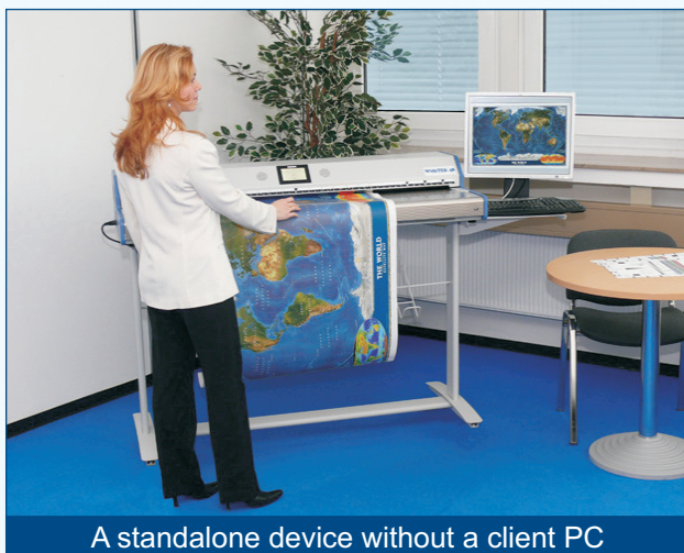
A standalone device without a client PC

The user operates the scanner either with a standard internet browser or alternatively, via the built-in touch screen. A monitor directly connected to the scanner can be used for image control or to modify the scan parameters, without a client PC. Using the touch screen display, up to 30 different password protected jobs can be defined and stored. The jobs contain preconfigured settings such as scan parameters or directories on the network drives.