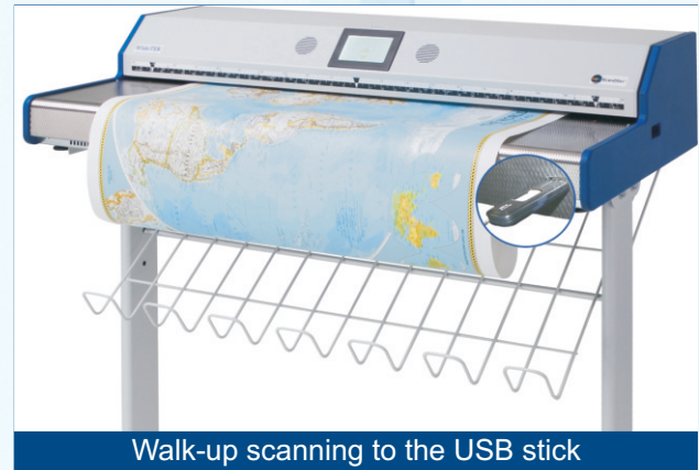
Walk-up scanning to the USB stick

The cutting edge camera technology, consisting of a dust-protected, hermetically sealed camera box holding CCD systems using a patented stitching procedure, delivers a resolution of 1200 dpi.