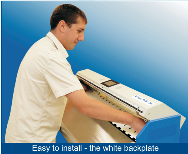
Easy to install - the white backplate

Effective and cost-efficient scanning of transparent documents