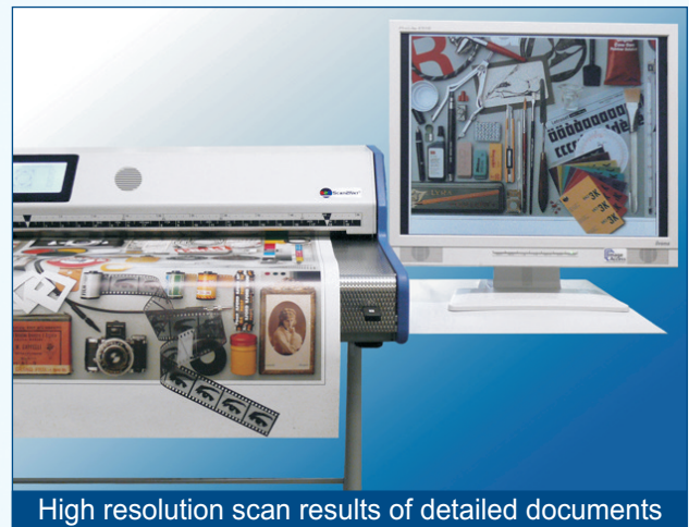
High resolution scan results of detailed documents

In combination with the optimized LED illumination, it achieves a clear and high-contrast reproduction of even the finest details of transparent documents. Utilizing an ingenious binarization algorithm, the white backplate option enables operators to get optimal brightness allocation of the image. Most documents, even with quality inconsistency, are automatically binarized using a single setting.