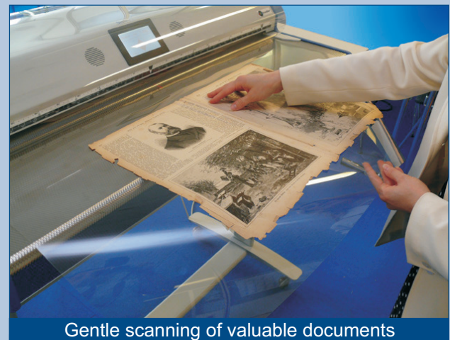
Gentle scanning of valuable documents

Automatic document size recognition allows operators to pass sensitive documents through the middle of the scan area, protecting documents from any damage.